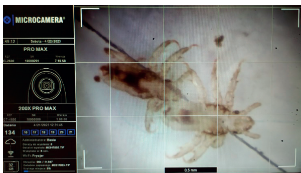
FIGURE 1. Lice inhabiting a child's head. The characteristic prehensile legs (claws) at the limb endings facilitate lice attachment to the hair shaft. Image magnified 200X obtained with the PROMAX – MCHD CONNECTED lens.

head lice (Fig. 1) allows them to attach to human hair. Smooth and slippery surfaces (plastic, metal, artificial leather) can hinder their movement [11]. Nonetheless, even on such surfaces, when in contact with a hairy head (e.g. on a hairdresser's chair, cosmetic chair, doctor's office couch, headrests on airplanes, cinemas, trains, buses, and cars), the parasite can instantly attach itself to the hair. The potential for lice transmission through shared combs, brushes, hairpins, toys, and through upholstered furniture or bed linen at home or in hospitality settings should not be underestimated. All types of fabrics used at home – including bedding, towels, and clothing – as well as treatment bedding in service centers, unless disposable (bedding, capes, undercoats, towels, etc.), should be washed at temperatures exceeding 60°C with the addition of agents such as Nitolic Wash. Adult lice can survive for several hours in cold, lukewarm, or warm water, while nits display even greater water resistance. Mishandling parasite infestation leads to rapid head lice spread and reinfestation.