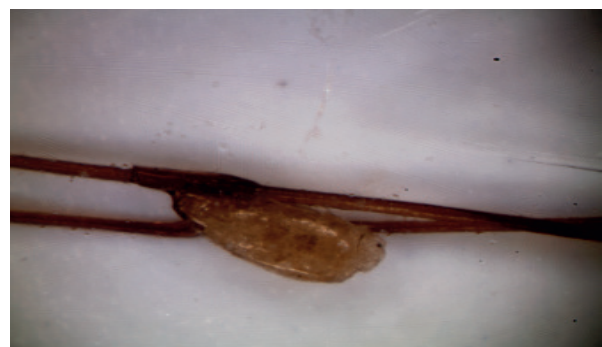
FIGURE 2. Nits attached to the hair of a 4-year-old child. Image captured with the PROMAX 200X – MCHD CONNECTED lens.

A physical examination was performed using the MicroCAMERA HD PRO MAX CONNECTED, manufactured by APR Instruments s.r.l. Coccaglio (BS), Italy. The camera is equipped with a lens that magnifies the image by 200 times. The lens is additionally protected with glass to prevent the tested parasites from entering and infecting other patients/clients. The glass protecting the lens undergoes a decontamination procedure before each use. During the examination of the child, various impurities were observed. These included deposits in the form of black dots (lice excrement), red dots (microscopic blood drops left after a lice bite), numerous nits on the hair shafts at their roots (new nits) and at their ends (several days old nits ready to hatch) – Figures 2, 3. The child's head exhibited many nymphs actively seeking food. Furthermore, an erythematous area with intensive scaling of the epidermis and a characteristic odor were noticed in the parietal region of the head. Two young nymphal lice were also visible around this lesion (Fig. 3).